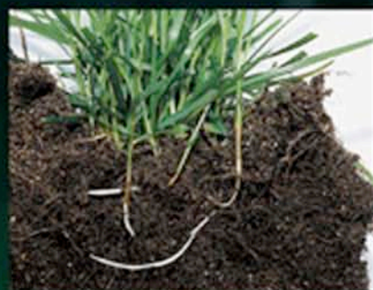
Smooth Stalk Meadow Grass